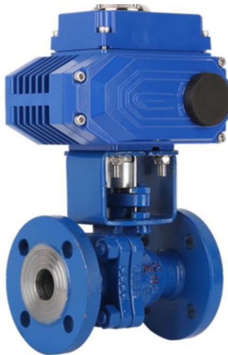
*Ball valve with electrical actuator